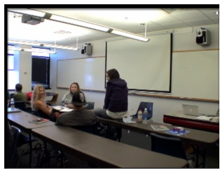
Figure 3: Most class time was devoted to small-group activities.

We commonly followed the following sequential progression: solo-preparation, pairwork, quad-work, group-share. Note that including pair-share virtually ensured that every student was engaged. When working singly, a student could easily disengage from the task at hand. When working in groups of 3 or more, a student could also adopt a non-participatory role. But when the situation involved interacting with just one other person, it was difficult and uncomfortable not to be involved. Thus including pair-work in the process ensured that the level of engagement would be high. (Of course, it was still possible for both students to be off-task.)