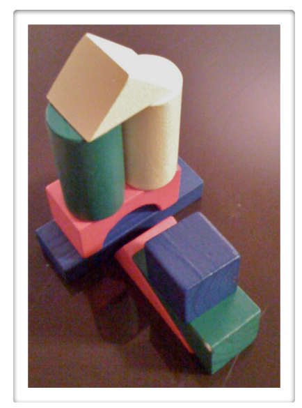
Figure 2: Tangible manipulatives (such as these building blocks) supported concept activation.

Effective group-work was one of the six computational thinking practices in the CS Principles curriculum framework in Fall 2010 (subsequently that thinking practice became Collaborating ). Students cringed and exhibited